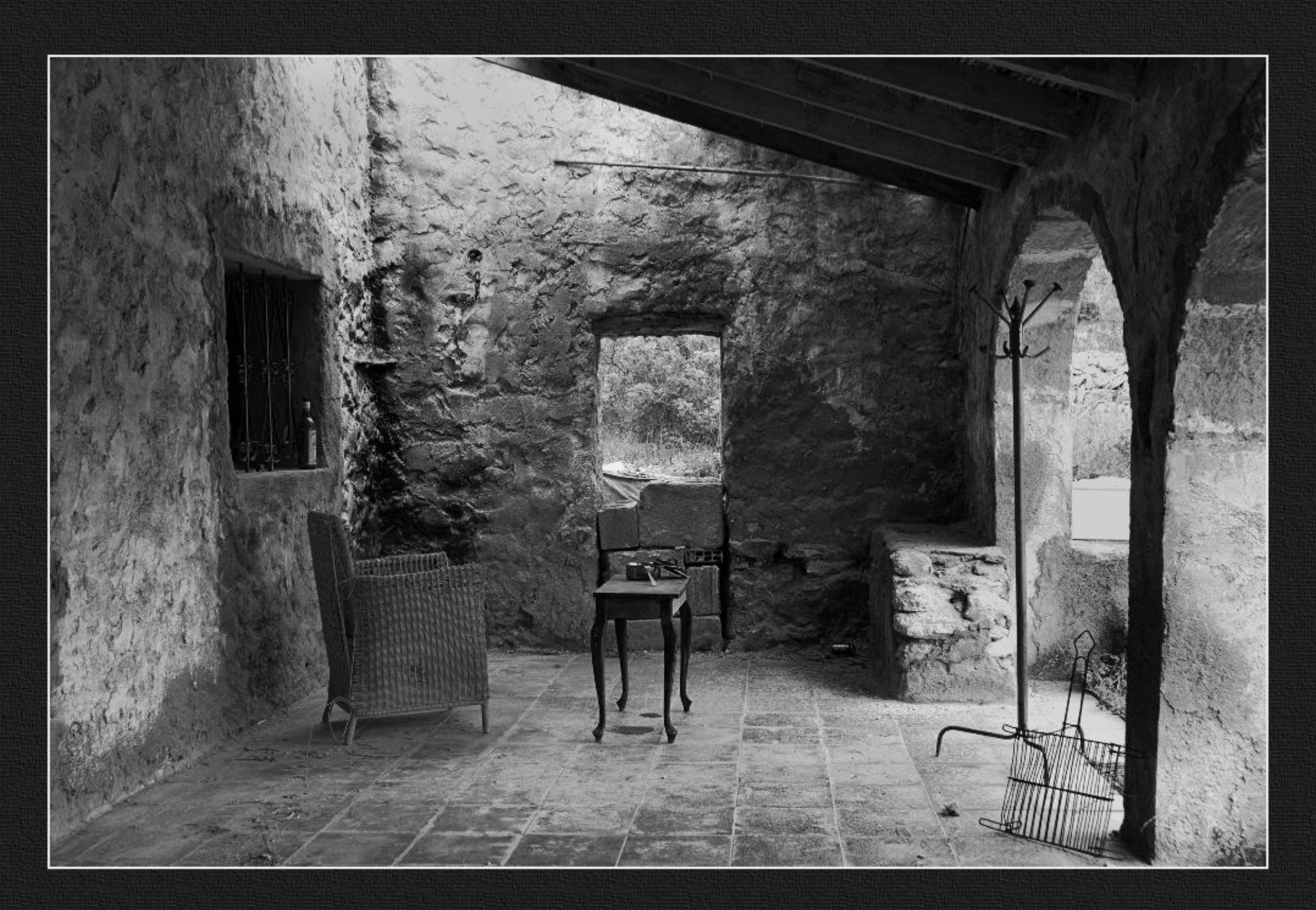
Interior riurau del Mosso - El Rafalet