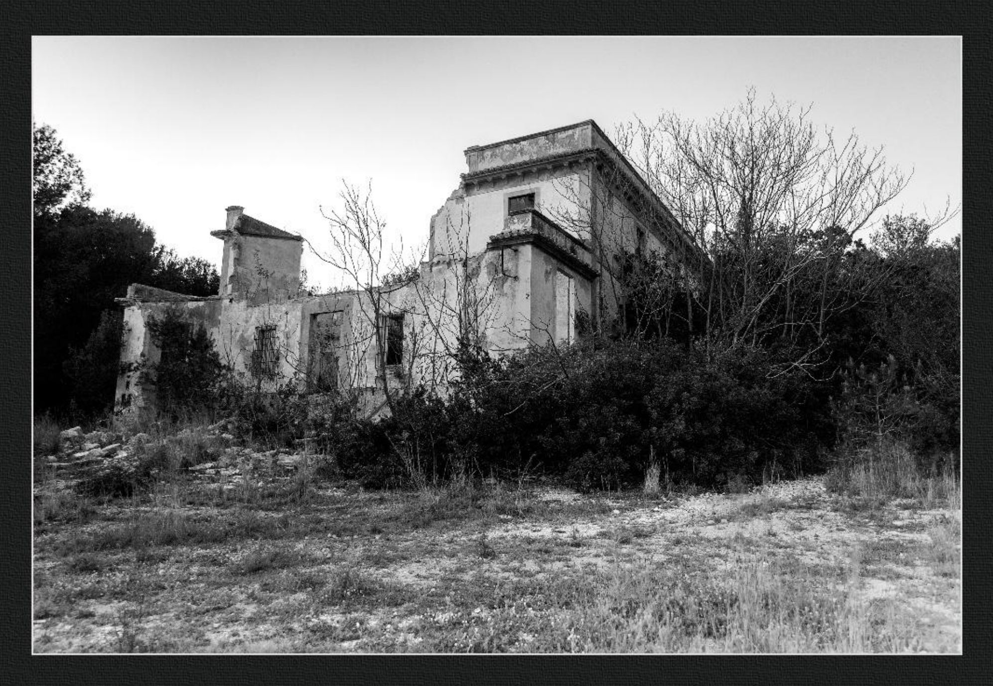
Casa dels Benimeli - El Rafal