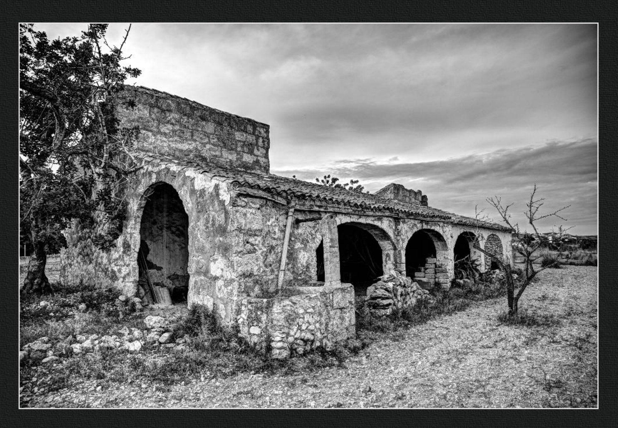
Riurau del Clot de Larion - La Riba