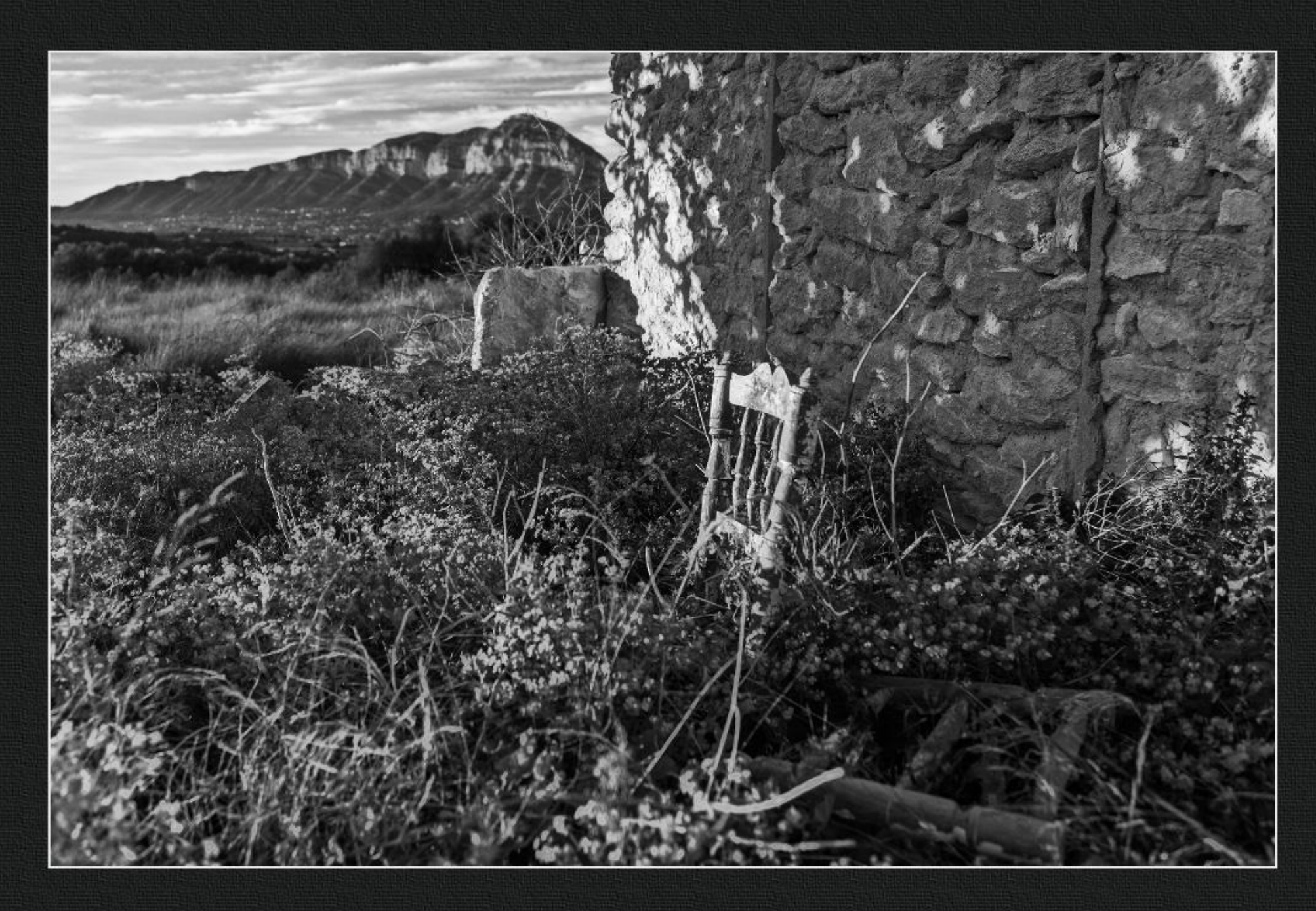
Casup Cansalades