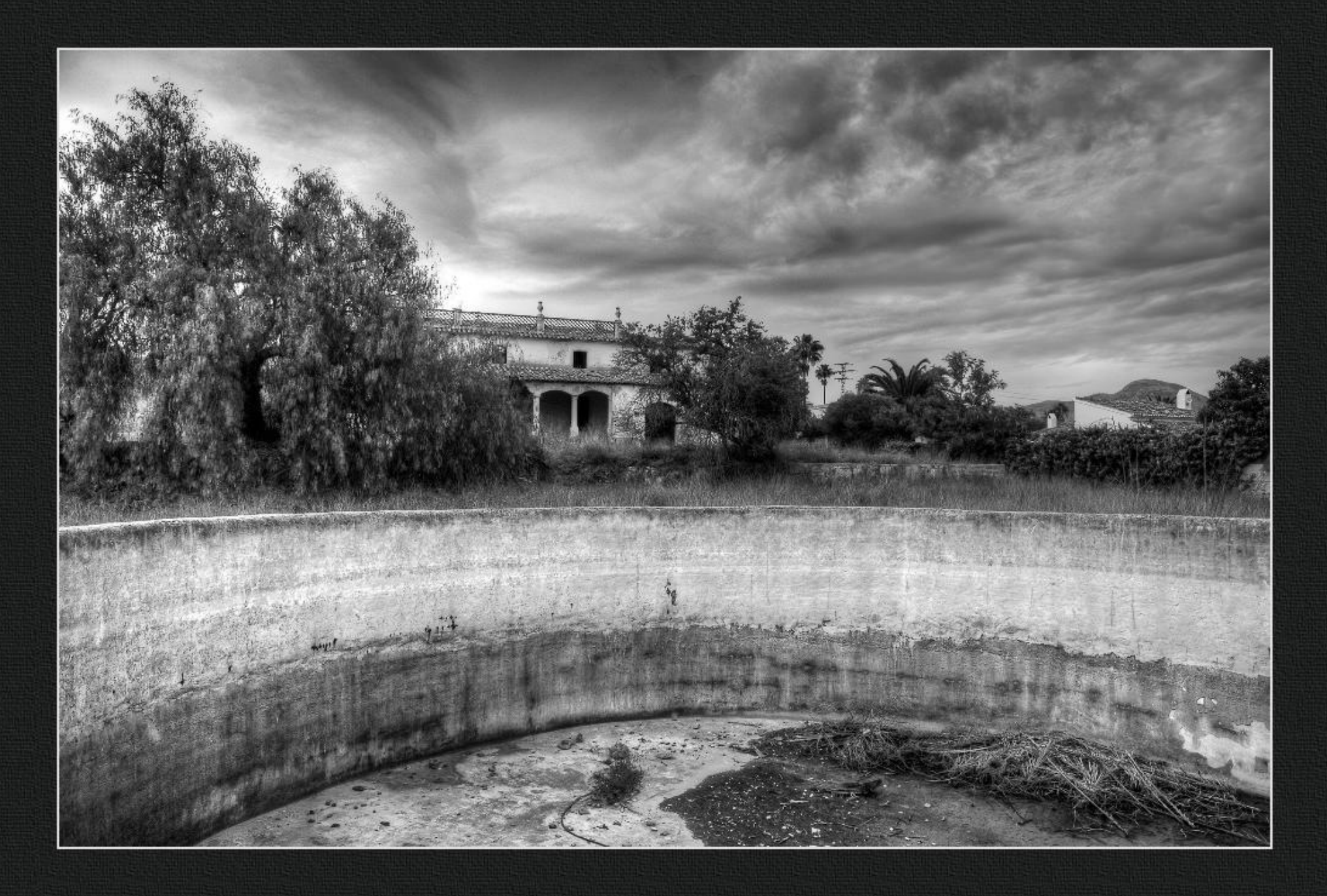
Caseta i bassa de Terra Soler - La Lluca