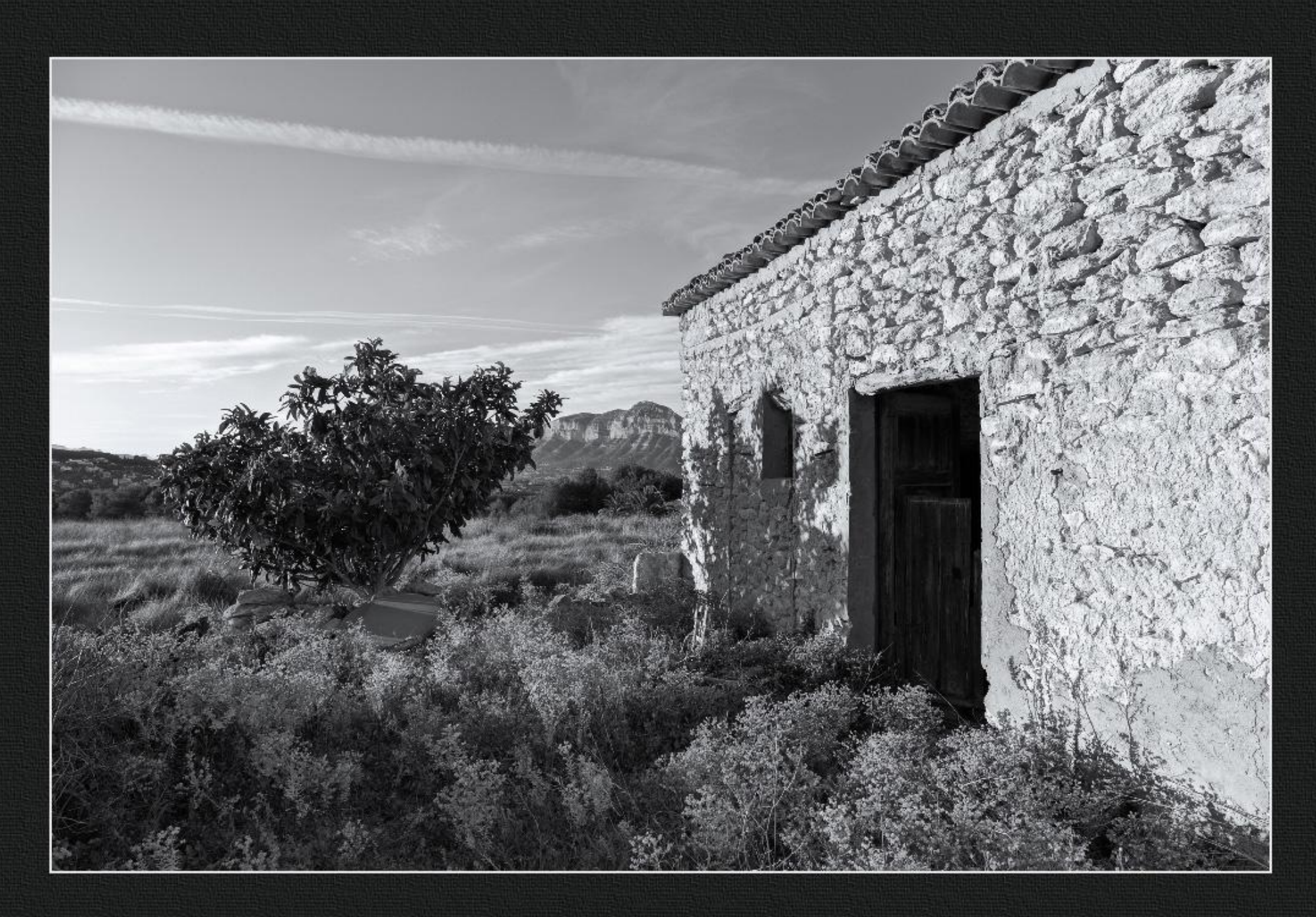
Casup Cansalades Foto: Vicente de Miguel