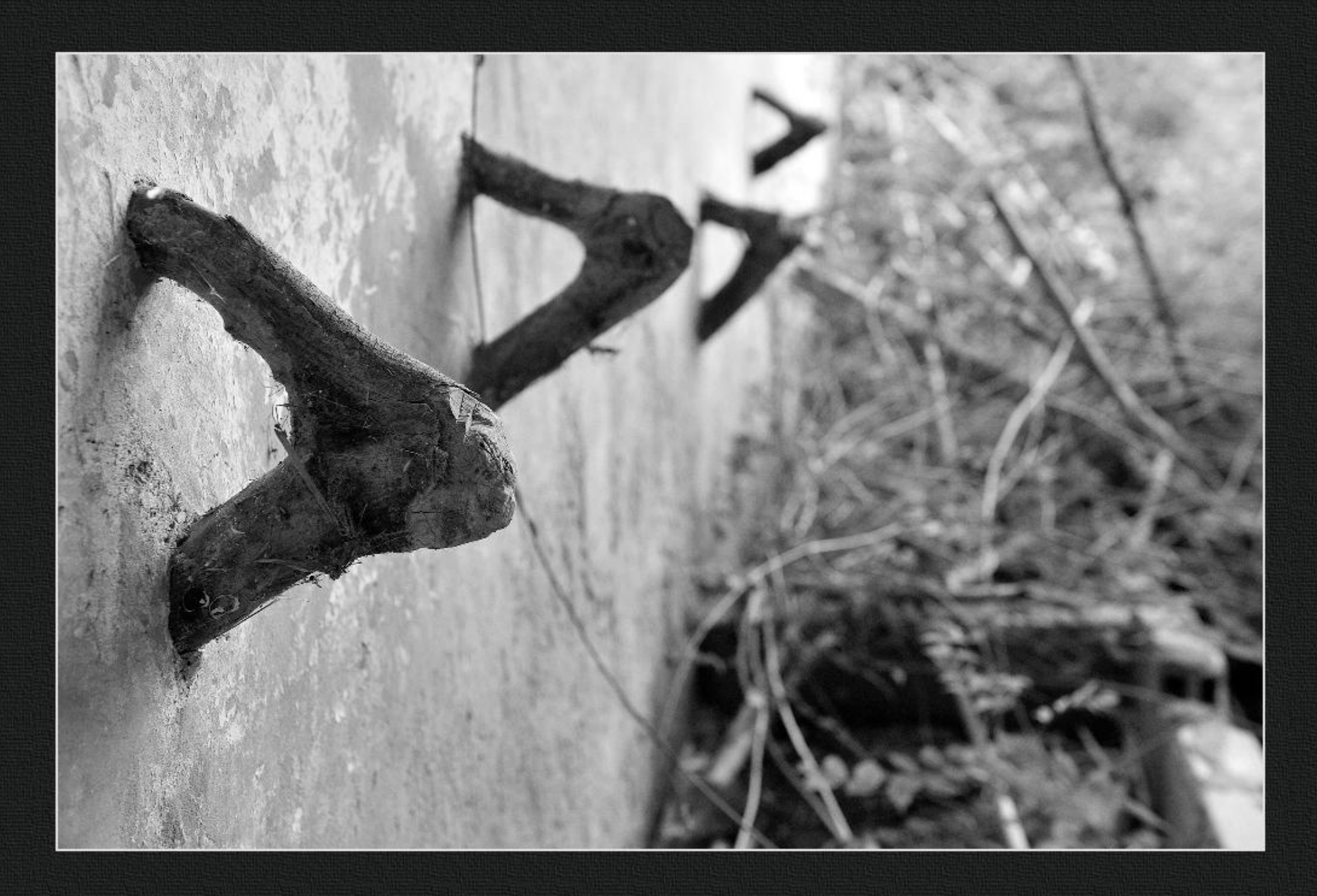
Estaques i pessebre. Caseta i bassa de Terra Soler - La Lluca