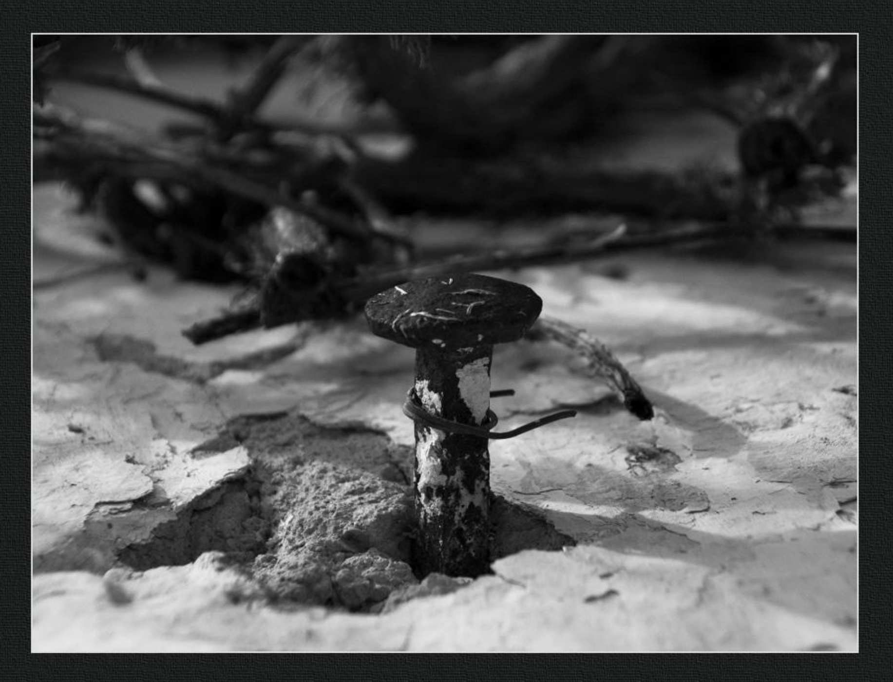
Detall casup de Cap de Martí