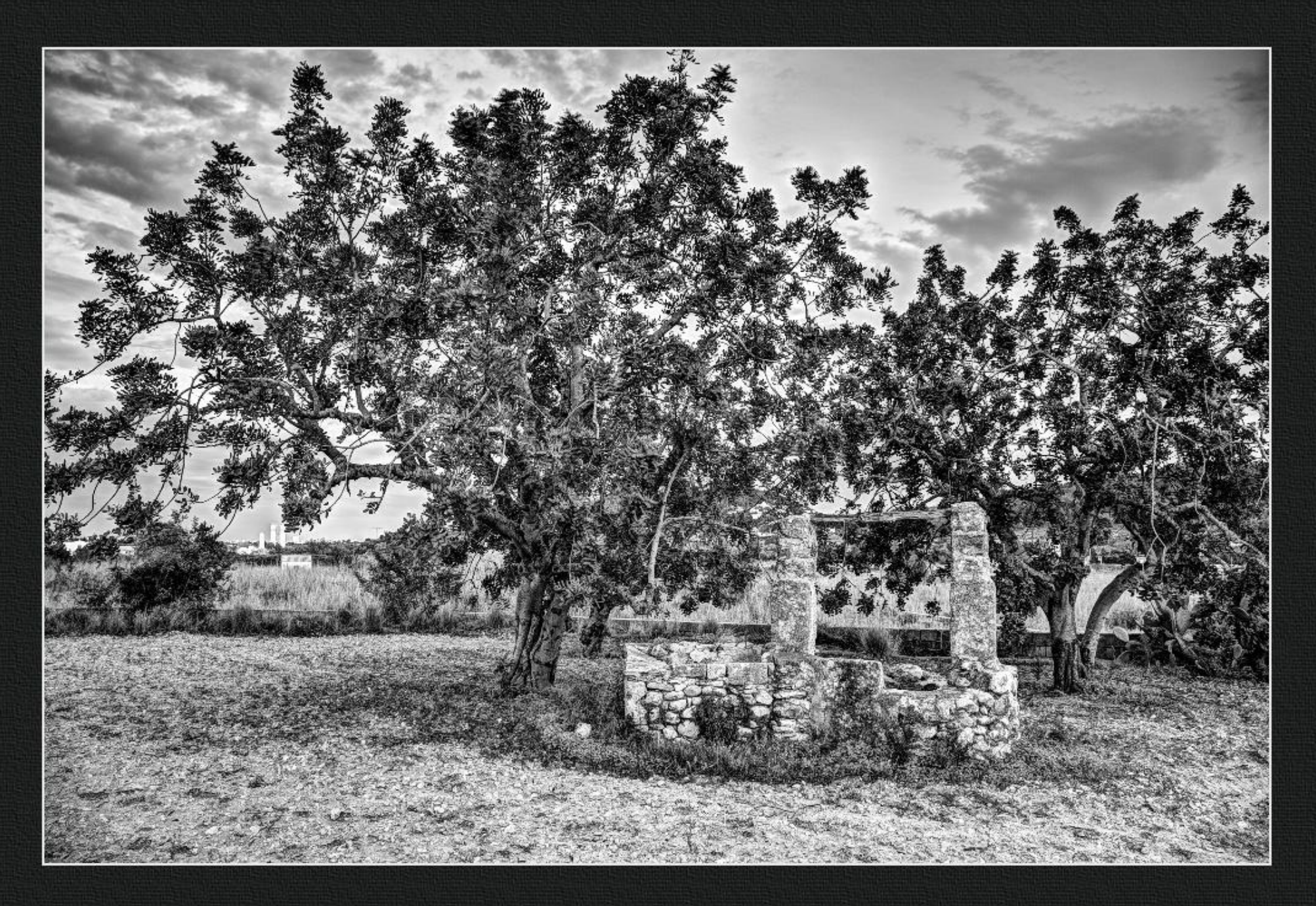
Pou i safreig. Riurau del Clot de Larion - La Riba