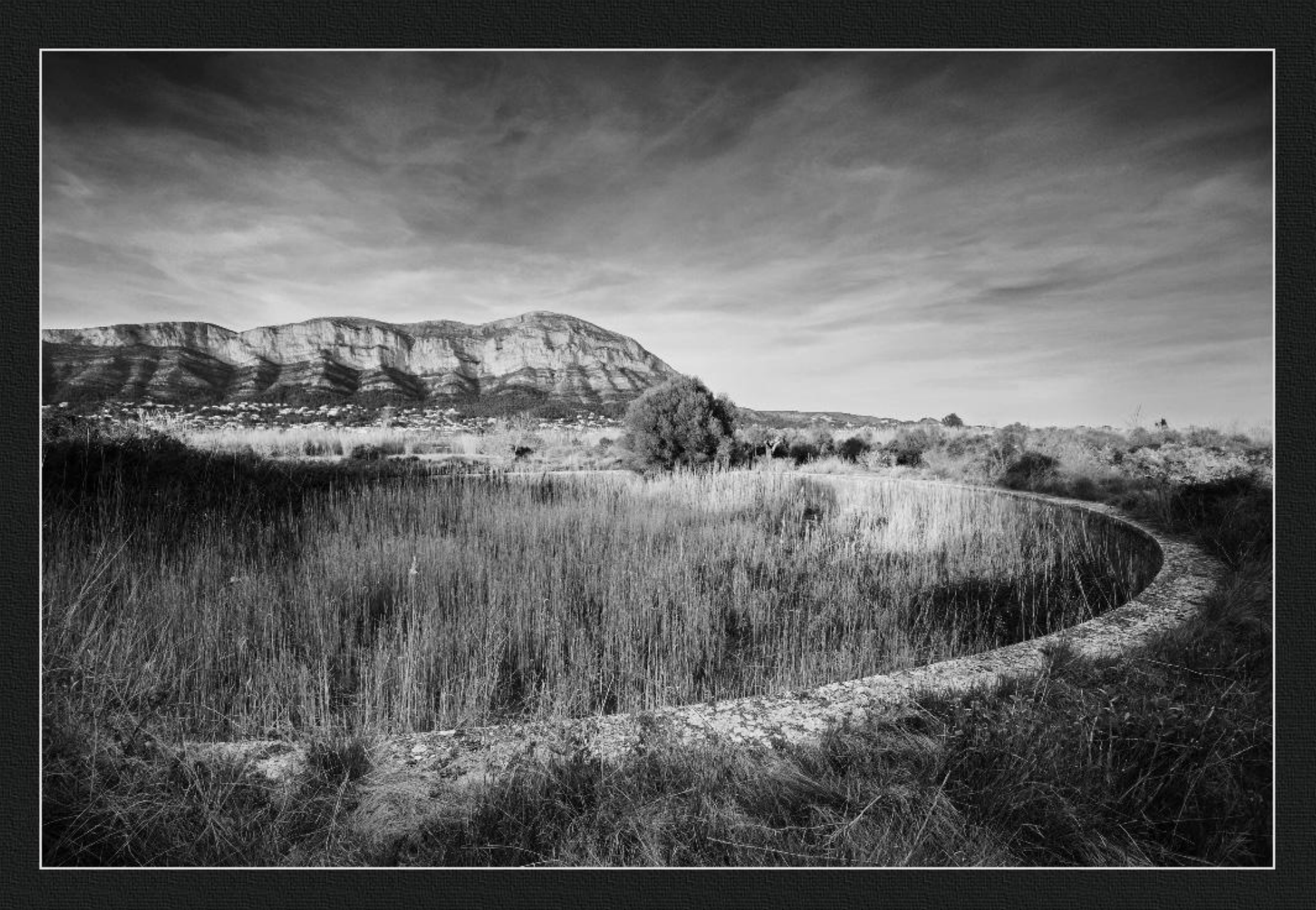
Bassa de Bolufer - Els Julians