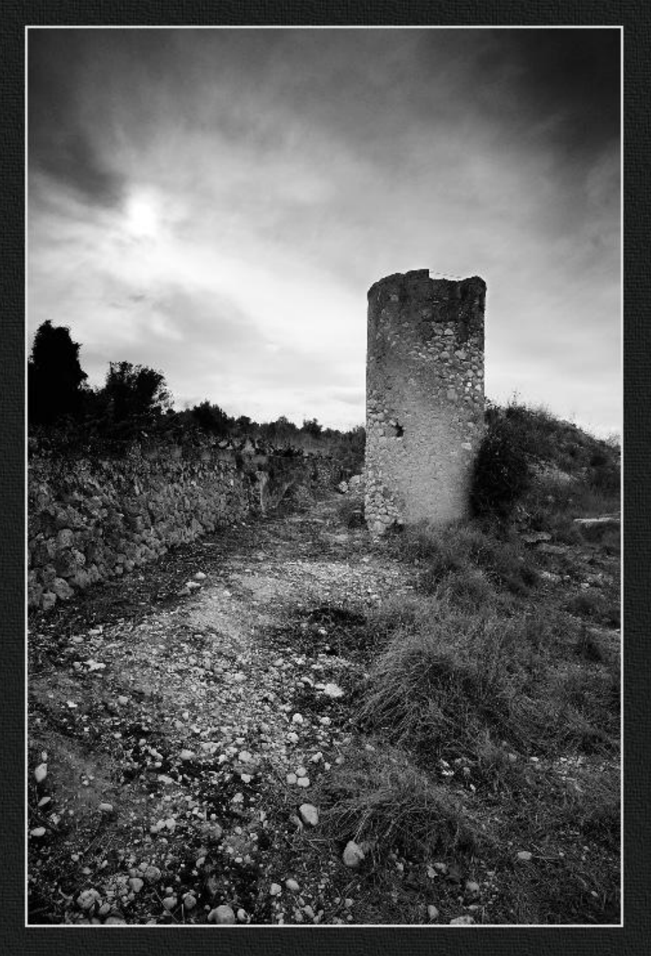
Molinet - Les Fontanelles