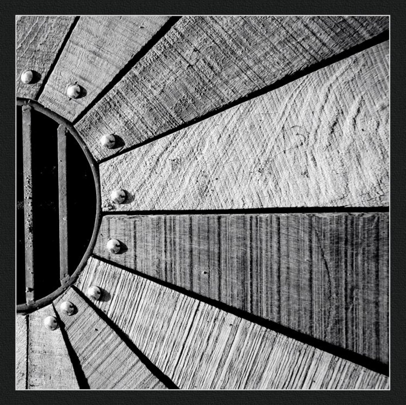
Detall Pou de Castells - Senioles