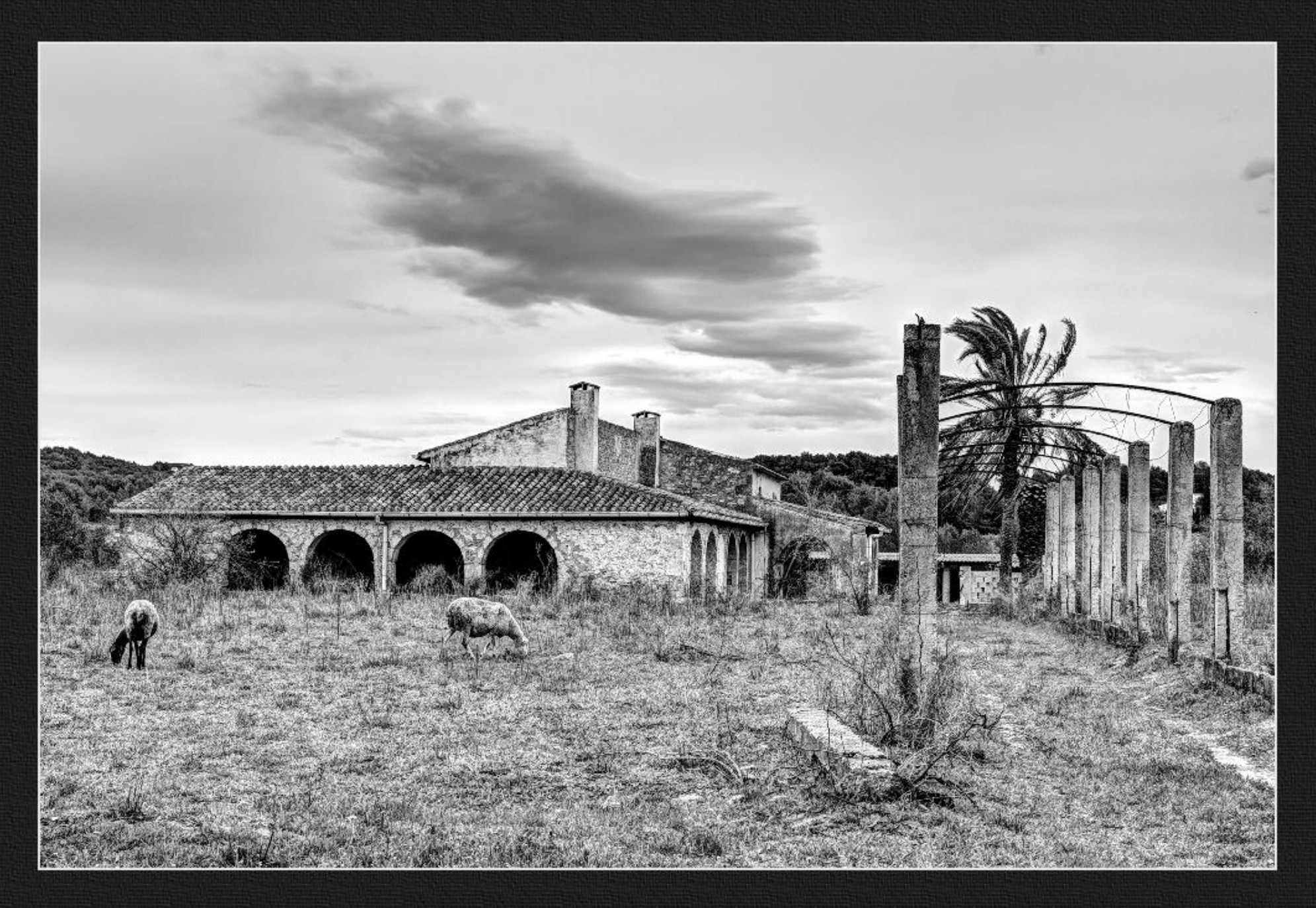
Riurau de la Pegolina - La Lluca