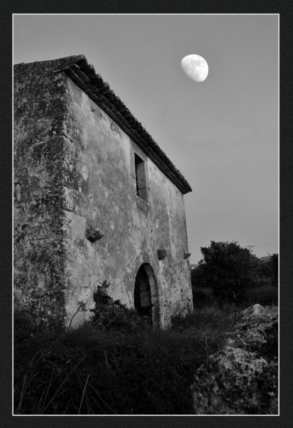
Casa de Tena - La Mesquida