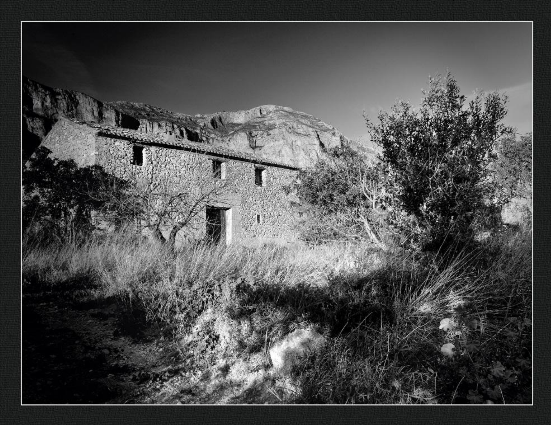
Alqueria - Les Valls