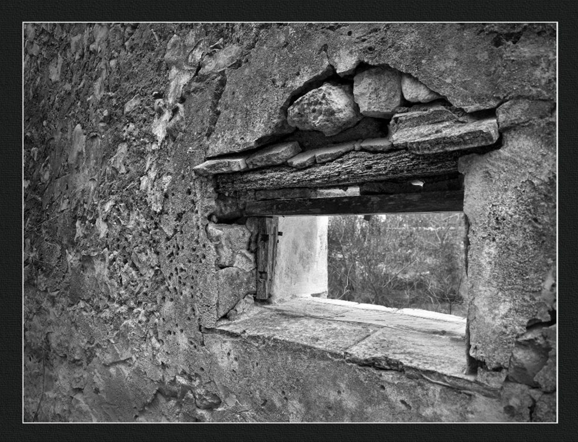
Finestró casa de les Memes - La Plana