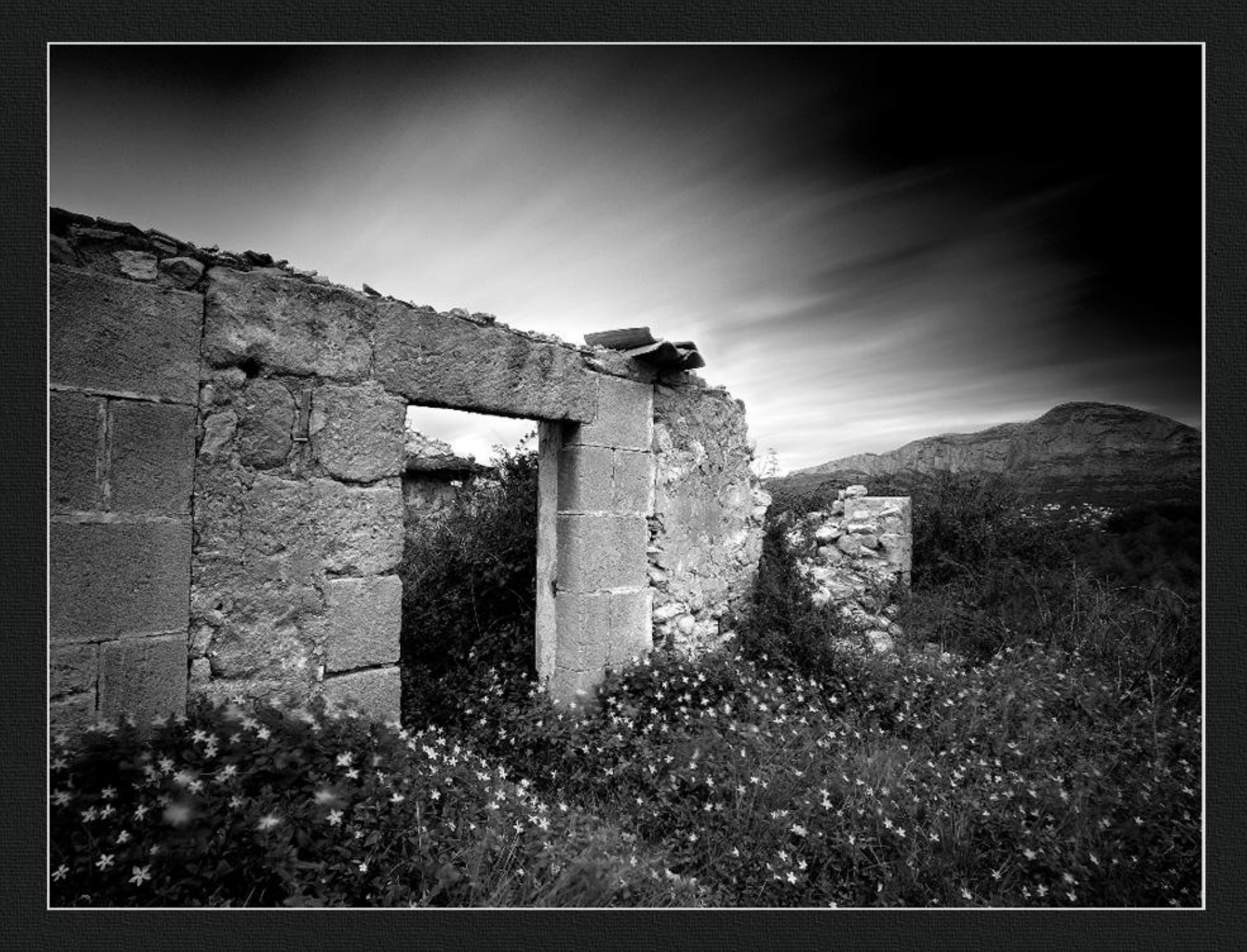
Brancalada de tosques. Casup - La Tarraula