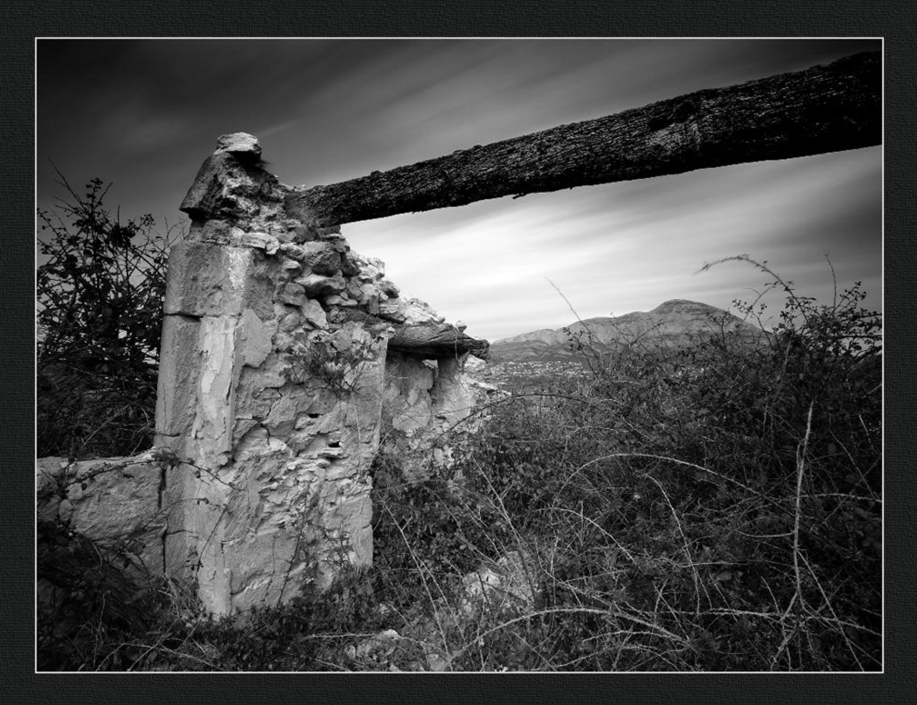
Jàssena. Casup - La Tarraula