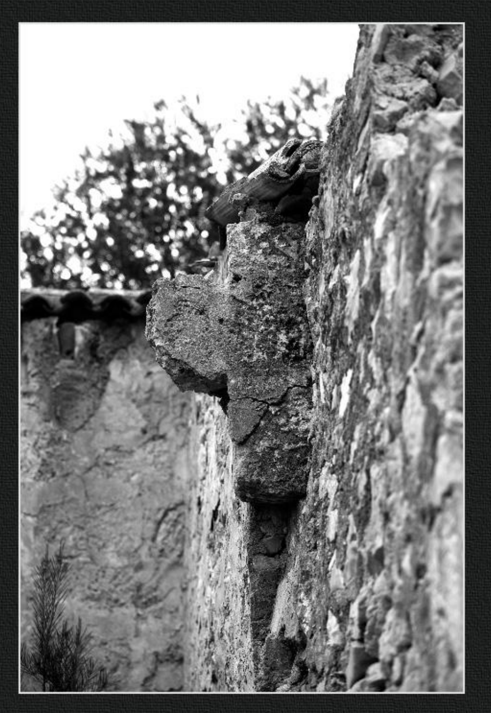
Detall casa dels Benimeli - El Rafal