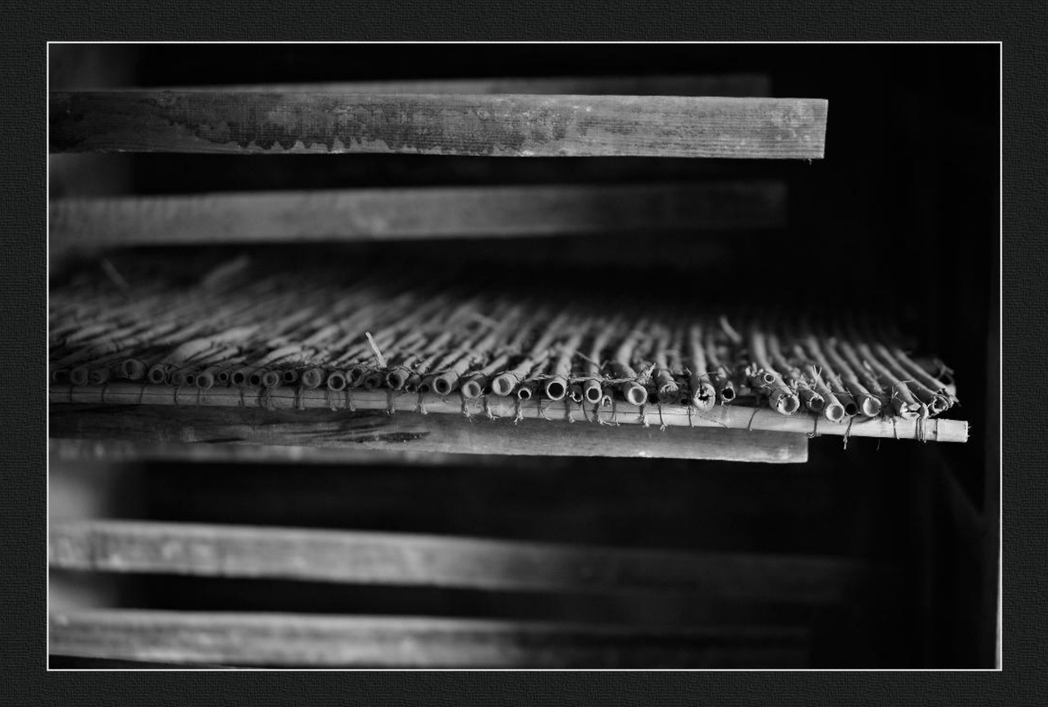
Estaques i canyissos. Estufa de la caseta dels Gostinos - La Lluca