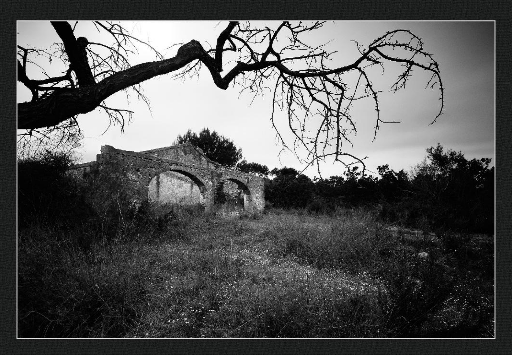
Riurau de Gaspanses