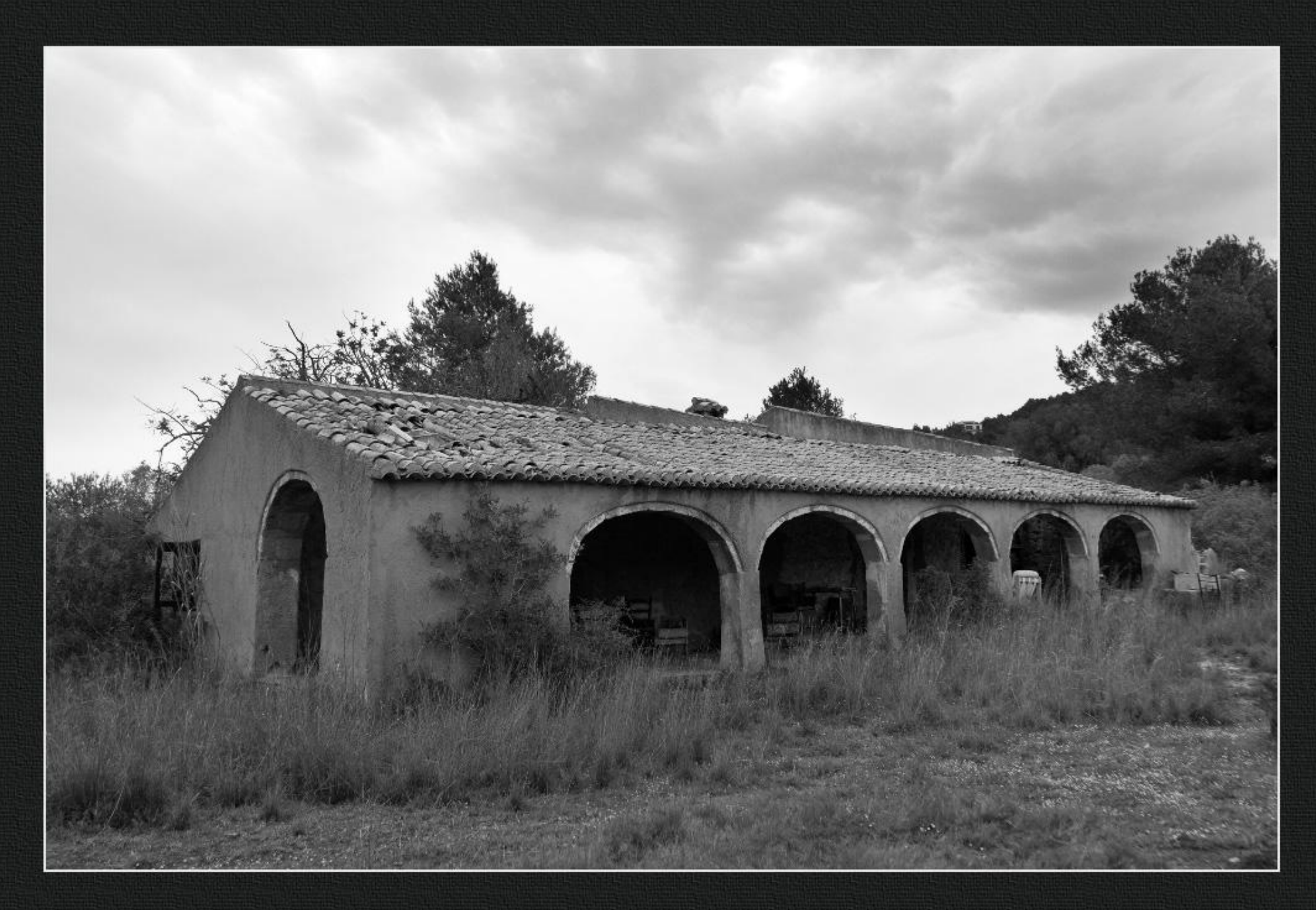
Riurau del Mosso - El Rafalet