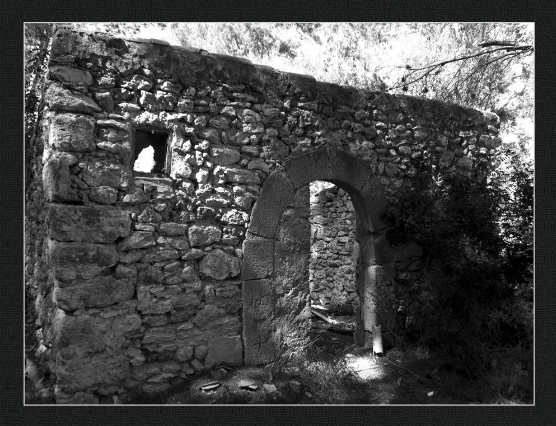
Casup de Cap de Martí