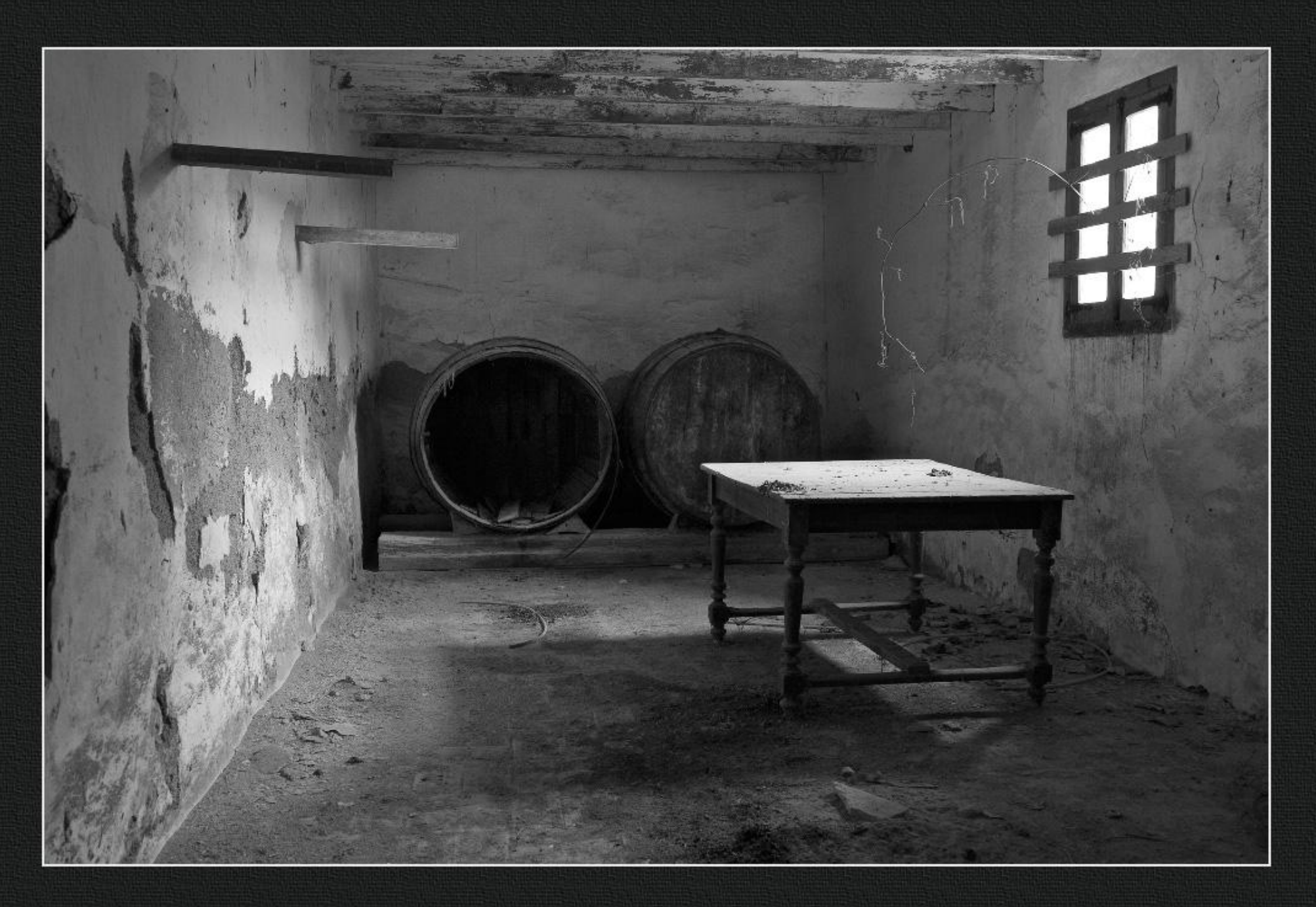
Botes i taula. Riurau de la Pegolina - La Lluca