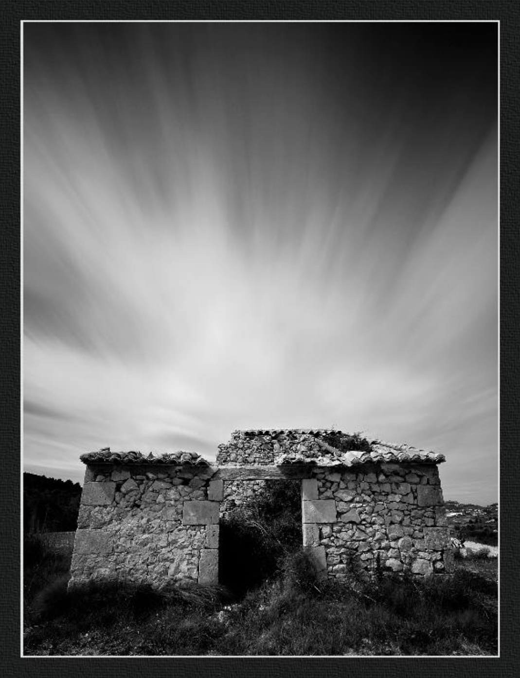
Frontera casup - La Tarraula