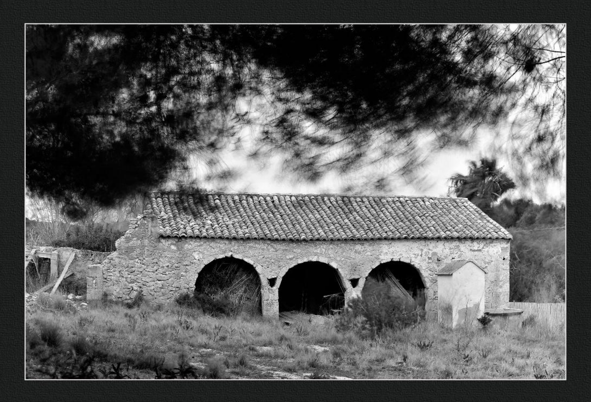
Estufa de la caseta dels Gostinos - La Lluca