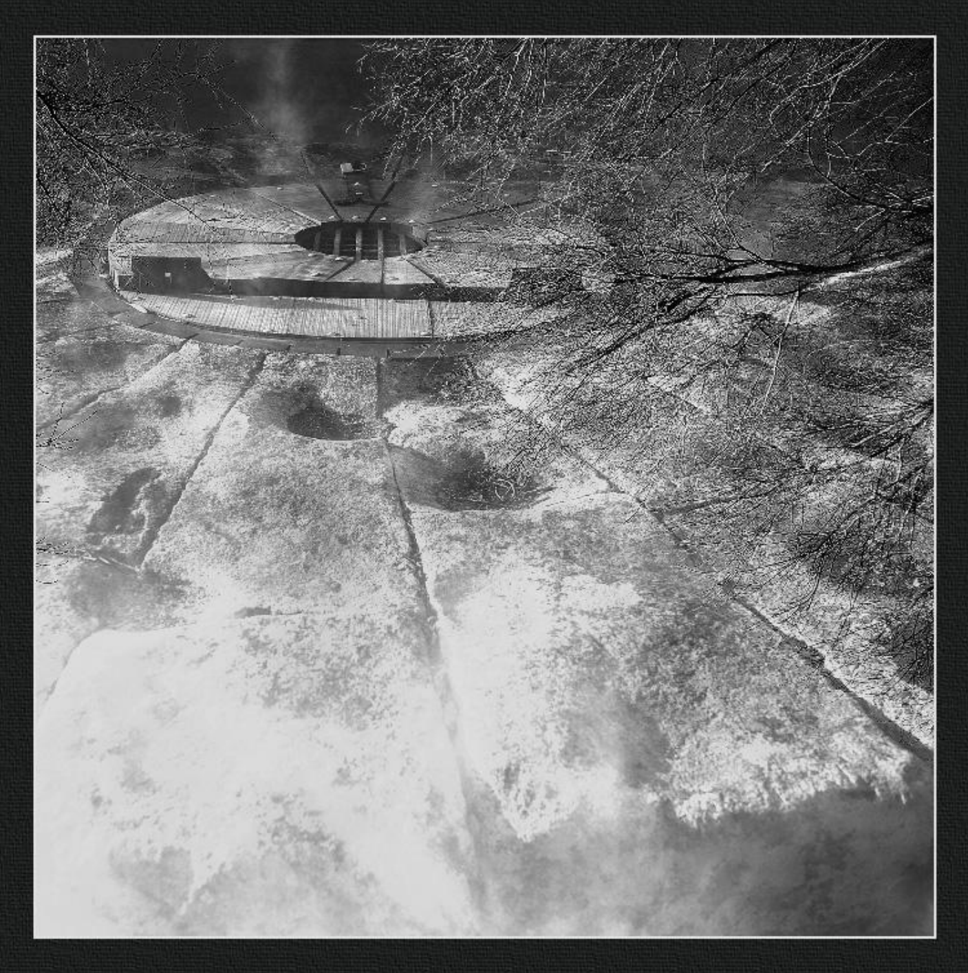
Pou de Castells - Senioles