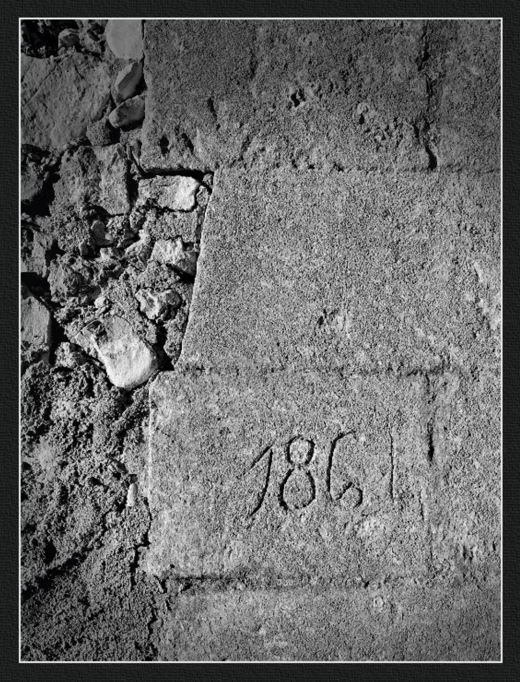
Detall de brancalada. Alqueria - Les Valls