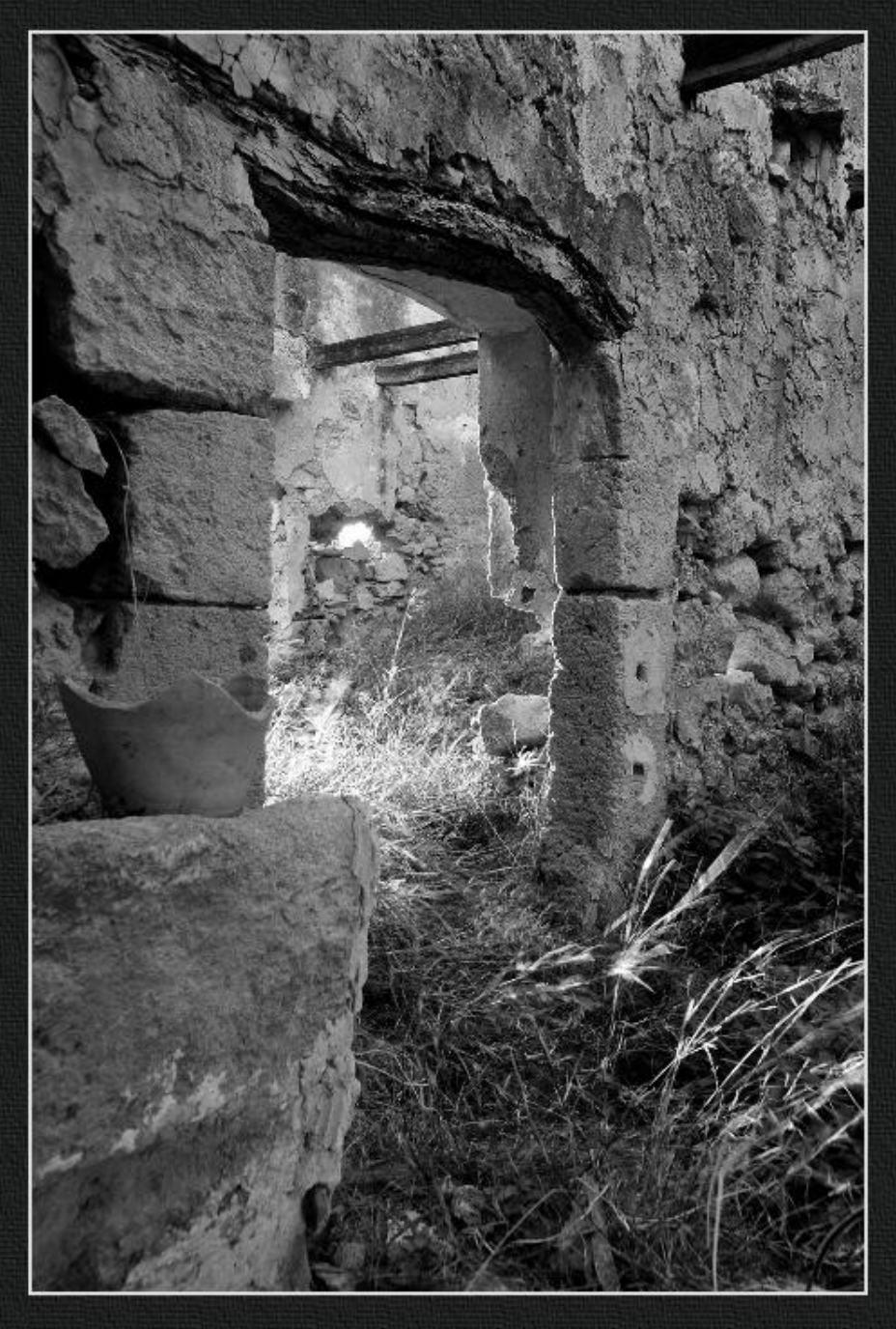
Estable casa de Tena - La Mesquida