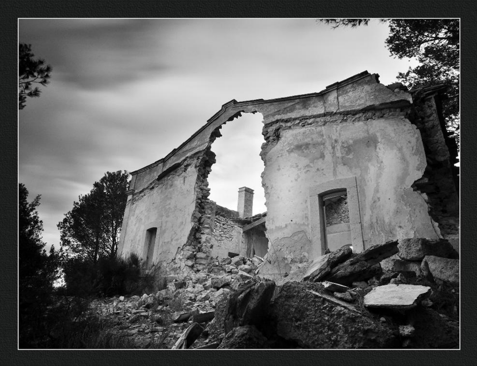
Casa de les Memes - La Plana